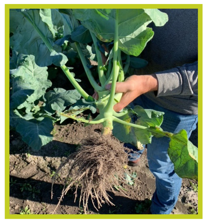
Roots of broccoli treated with MeloCon LC in trial in North Carolina. November 2021