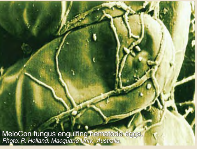
"...The spores germinate and penetrate the nematode, killing it by feeding on the nematode's body contents. MeloCon is brutal to nematodes and highly effective."

A biopesticide, MeloCon has minimal impact on the environment and non-target species. "But there is nothing