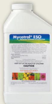
Sizes: 1qt, and 1gal.

Mycotrol's mode of action is unlike any conventional insecticide. The applied spores infect directly through the outside of the insect's cuticle (the skin). Spores adhering to the host will germinate and produce enzymes that attack and dissolve the cuticle, allowing them to penetrate the skin and grow into the insect's body. As the insect dies, it will change color to pink or brown, and eventually the entire body cavity is filled with fungal mass. The most common visible indication of insect death is a discoloration of the immatures. It is not necessary for a white fungal growth to be visible to know the product is working; the insect is killed before this happens.