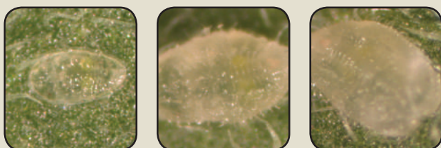
Untreated whitefly nymphs