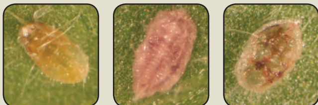
Treated whitefly nymphs